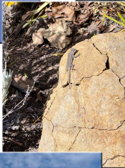
Lizard climbing "Mt Everest" by Lorraine Villarreal