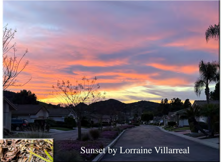
Sunset by Lorraine Villarreal