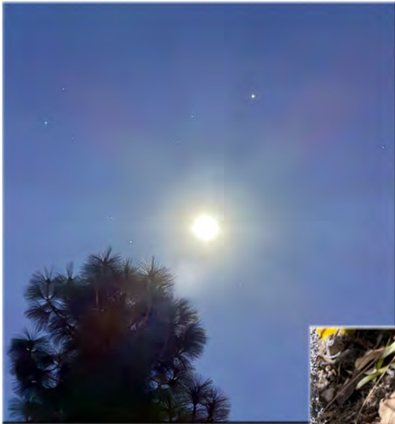
Moon & Planets by Lorraine Villarreal